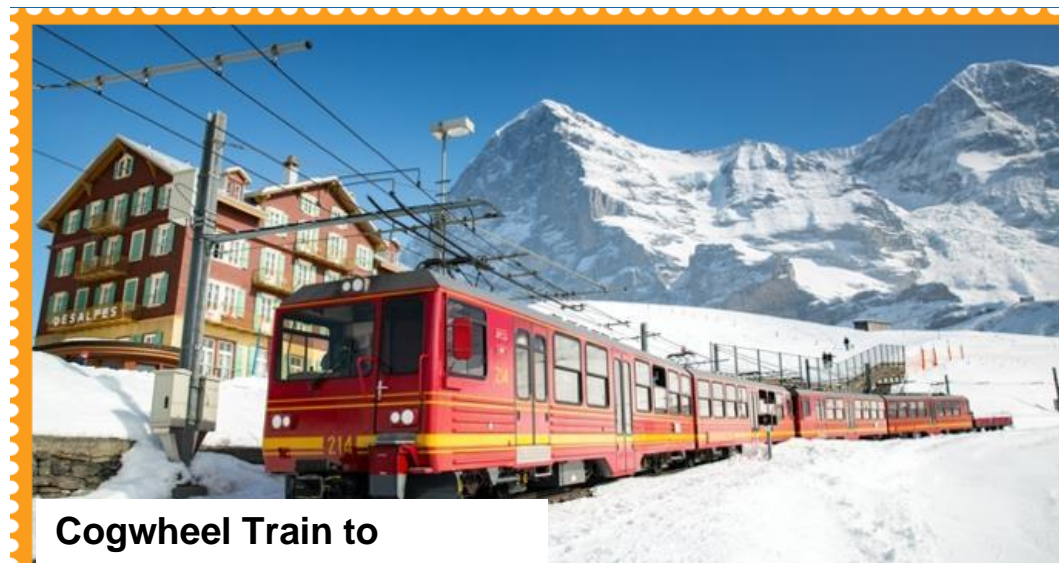
Cogwheel Train to

Upon arrival, you'll find yourself in a realm of eternal ice and snow, where natural beauty knows no bounds. Explore the enchanting Ice Palace, where skilled artists craft their masterpieces from ice.