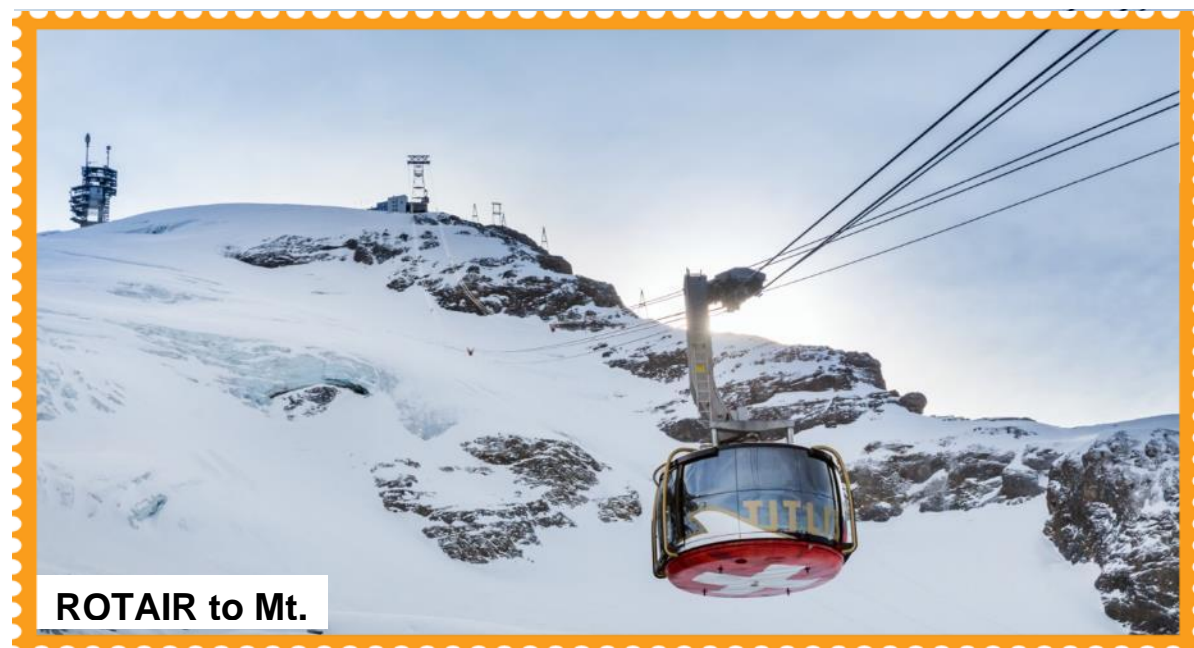
ROTAIR to Mt.

Overnight stay at the hotel in Central Switzerland. (Breakfast, Lunch, Dinner).