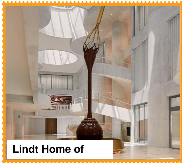
Lindt Home of

Our journey continues to Engelberg, where you'll be treated to breath taking scenery and a once-in-a-lifetime experience. We'll embark on an exhilarating trip to the summit of Mt. Titlis, reaching an elevation of 3,020 meters by way of various cable cars, including the Rotair, renowned as the world's first revolving cable car. At this lofty vantage point, prepare to be awestruck by a breath taking, unobstructed 360-degree panorama. You'll take in stunning views of the snow-capped peaks, deep crevasses, and pristine white snowfields, adorned with massive ice boulders, visible from every angle. Don't forget to include a visit to the "Cliff Walk," Europe's highest suspension bridge, perched along the cliffs of Mt. Titlis.