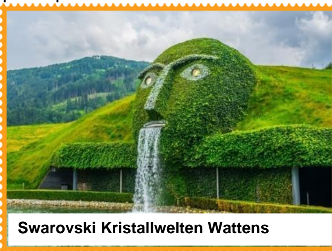
Swarovski Kristallwelten Wattens

Drive to Vaduz, the capital at the Principality of Liechtenstein with a guided mini train ride. Visit Swarovski Crystal Museum – the dazzling world of crystals. Visit Innsbruck – The Tyrolean capital of picturesque Austria.