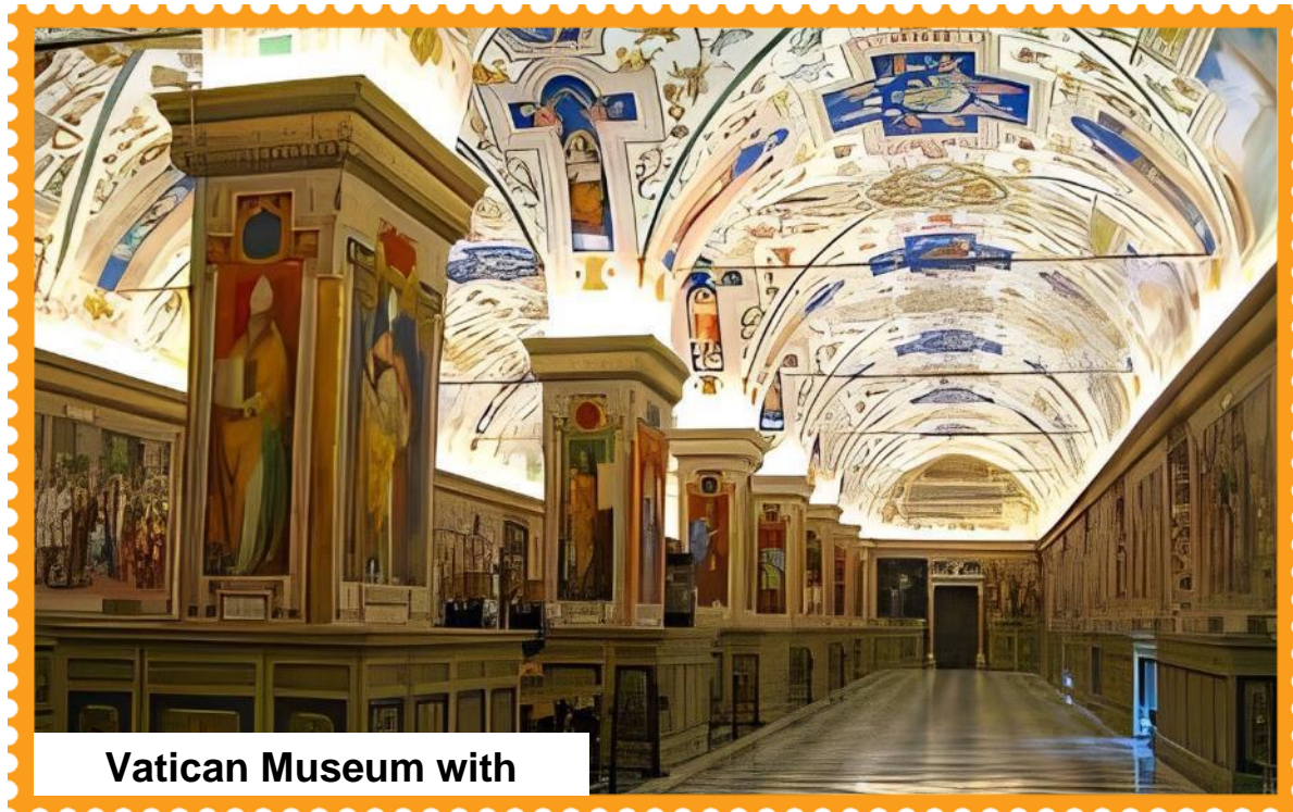
Vatican Museum with