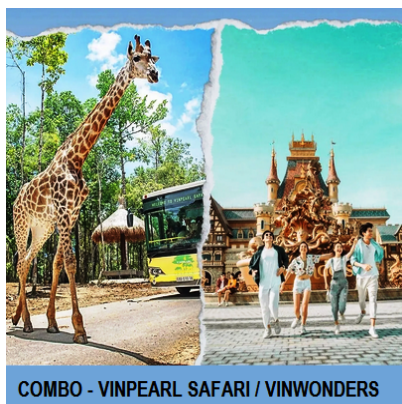
Vinpearl Safari and Vinwonders (Combo Ticket) With Transfer