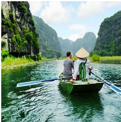
Ninh Binh Day Tour - (Hoa Lu , Tam Coc/Trang An, Boat Ride)