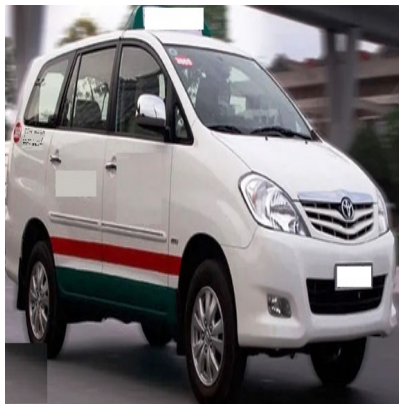
Airport Transfer - 1 way (North Phu Quock Area Hotel/Resort)