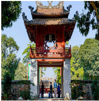
Half Day Afternoon City Tour Hanoi (SIC)