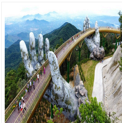
Ba Na Hills Guided Tour with Indian Lunch