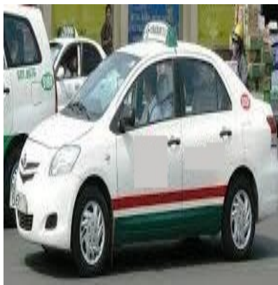
Danang Airport to Danang Hotel Transfer