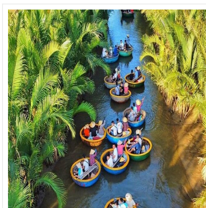
Coconut Forest & & & Basket Boat || Hoi An Ancient Town With Dinner