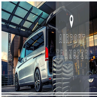
Danang Hotel to Airport Departure Transfer