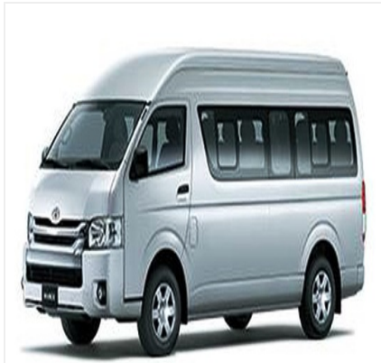
Halong Bay to Hanoi City/Airport Private Transfer (One Way)