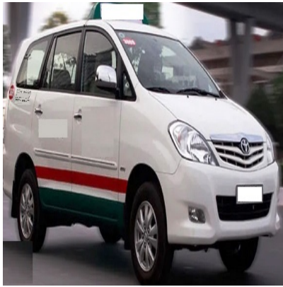
Hanoi Airport Arrival Transfer to Hanoi Hotel