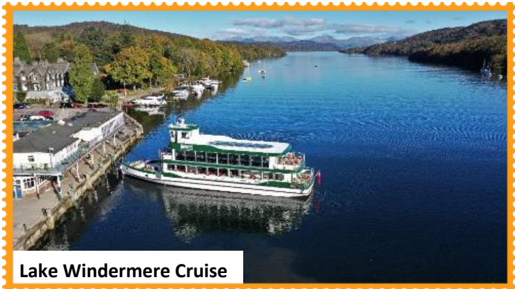
Lake Windermere Cruise

Today morning check out and embark on a visit to tranquil Lake District, considered the finest of England's National Park. Enjoy the Windermere Lake Cruise - the most popular attraction in Cumbria. Windermere is England's largest lake, in the heart of the Lake District. Later at Scottish Highlands experience how whisky is been made and the process of creating the finest Scottish Whisky. Next, continue to Glasgow city - famous for its contributions to architectural styles, with the Glasgow School of Art being the most notable example. Check-in to the hotel and relax.